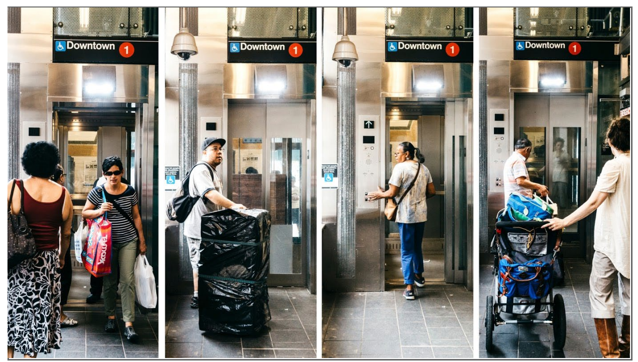
<u>The Americans with Disability Act at 25</u>

We make online education accessible to ensure all students have equitable access to your instruction and materials. With this in mind, accessibility should be a concern for all of us , regardless of our roles on campus. eSAIL is committed to assisting faculty in the College of Engineering with this process, so no one person is expected to do this alone.